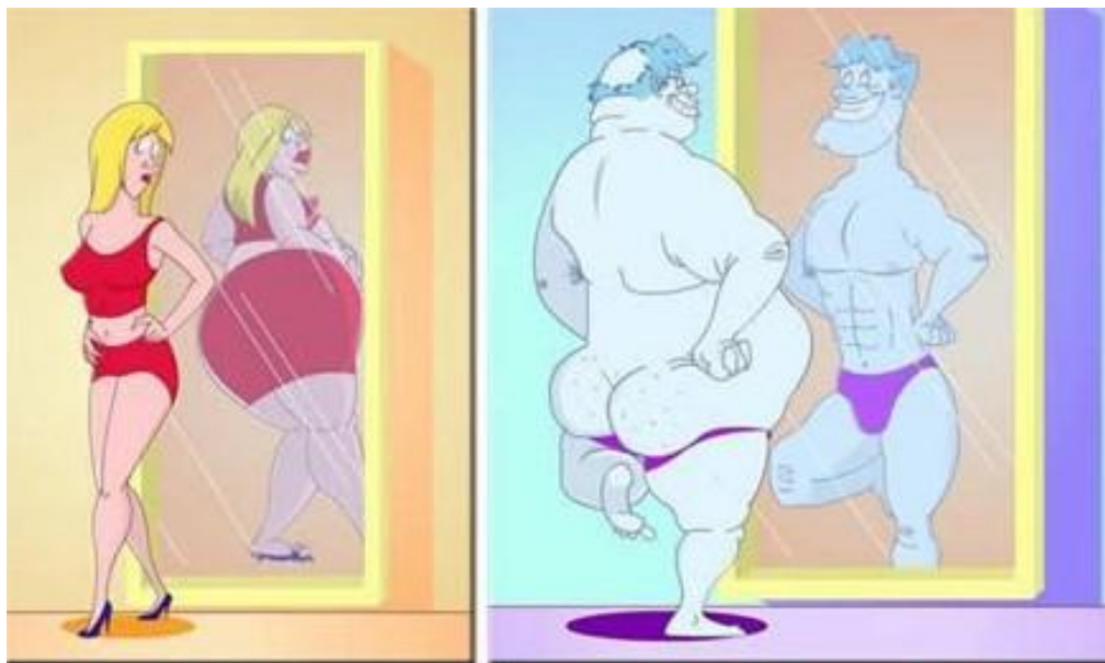
The Difference Between Women & Men

You get the point, and now should be a newfound believer in the force. A good sales manager or club owner can watch the sales area from 30 feet away, unable to hear any verbal communications, but still be aware of what is taking place at each and every table. You do not have to hear what they are saying because you can "see" everything they are saying just fine.